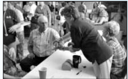
Kiwash member/board of director takes advantage of the health fair during the 2005 Annual Meeting. The health fair was provided by the Cordell Memorial Hospital.